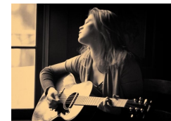
7th Annual IAMA (International Acoustic Music Awards) Accepting Entries